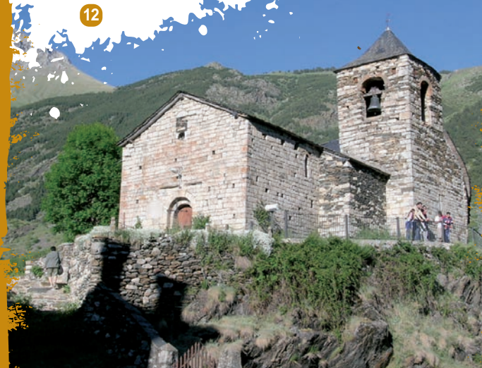
Sant Vicenç de Capdella church

LA VALL FOSCA MUNICIPAL TOURIST BOARD La Torre de Capdella Tel. +34 973 663 001 turisme@vallfosca.net www.vallfosca.net